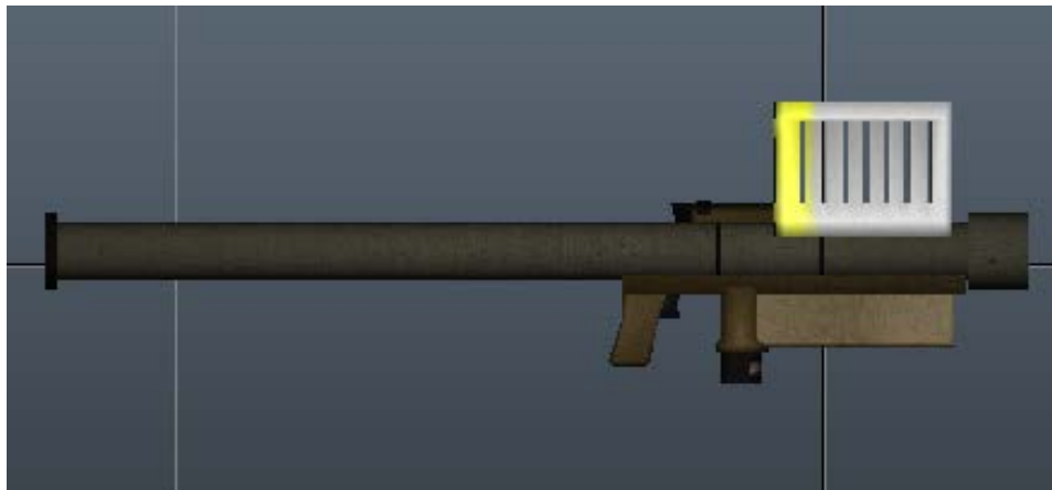
Figure 1 Stinger FIM 92 Weapon Model