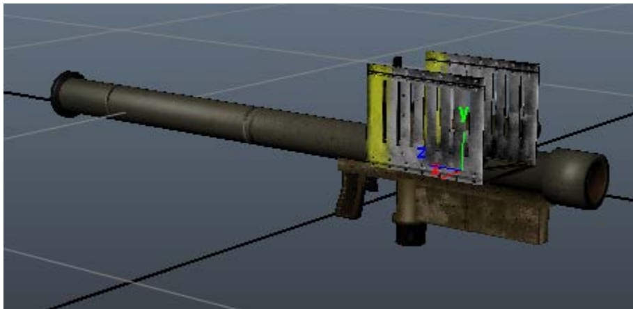
Figure 2 Stinger FIM 92 Origin on Cartesian X, Y, Z Coordinate System