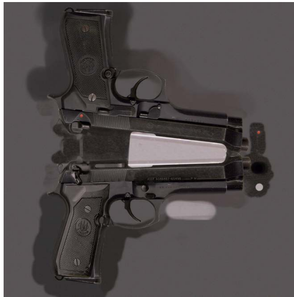
Figure 3 M9 Pistol Texture Map