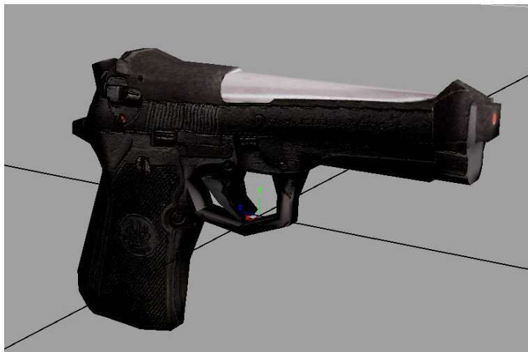
Figure 2 M9 Pistol Origin on Cartesian X, Y, Z Coordinate System