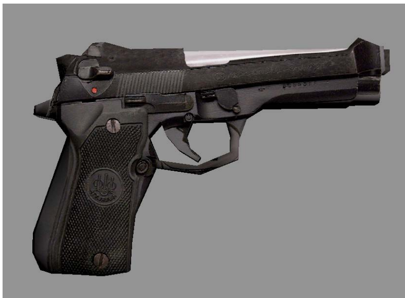
Figure 1 M9 Pistol Weapon Model