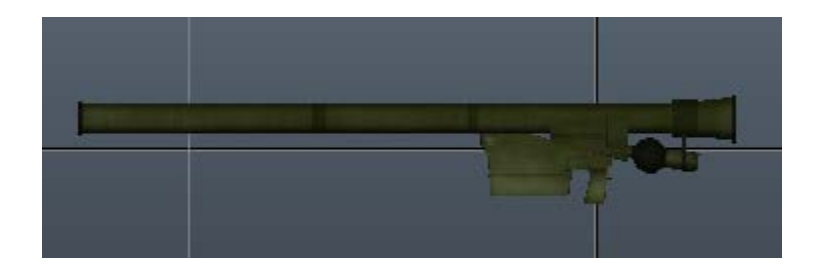
Figure 1 SA18 Grouse Weapon Model