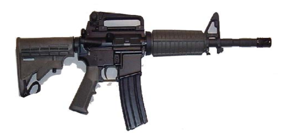
Figure 3 M4 Carbine Texture Map