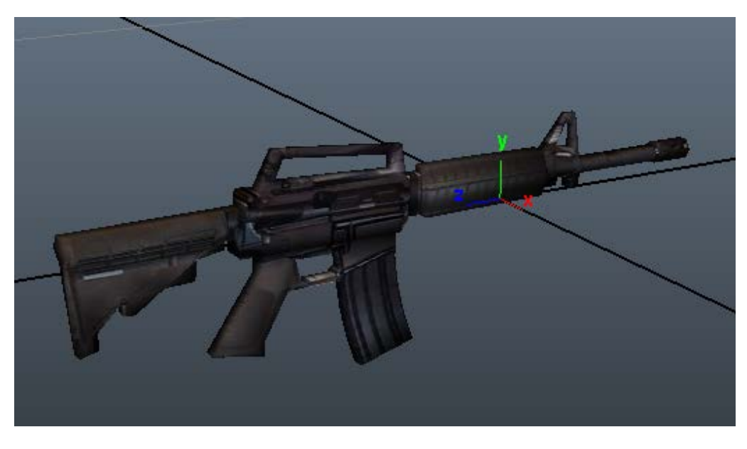
Figure 2 M4 Carbine Origin on Cartesian X, Y, Z Coordinate System