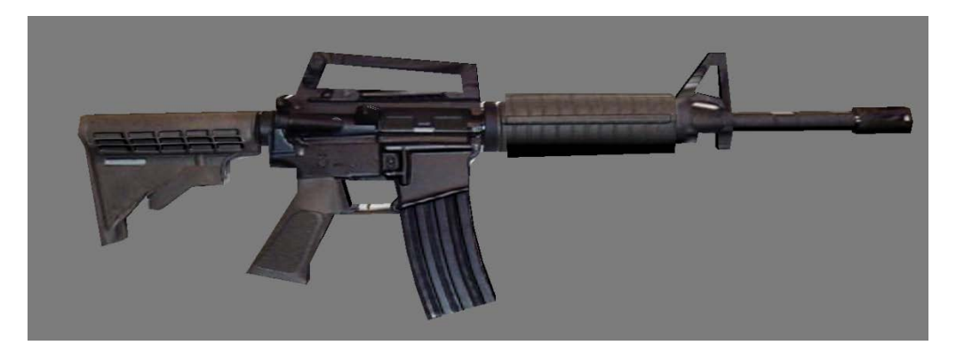
Figure 1 M4 Carbine Weapon Model