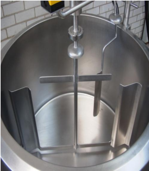
Figure 2 Vat Pasteurizer Interior Reference Image