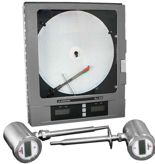
Figure 4 Vat Pasteurizer Chart Recorder Reference Image