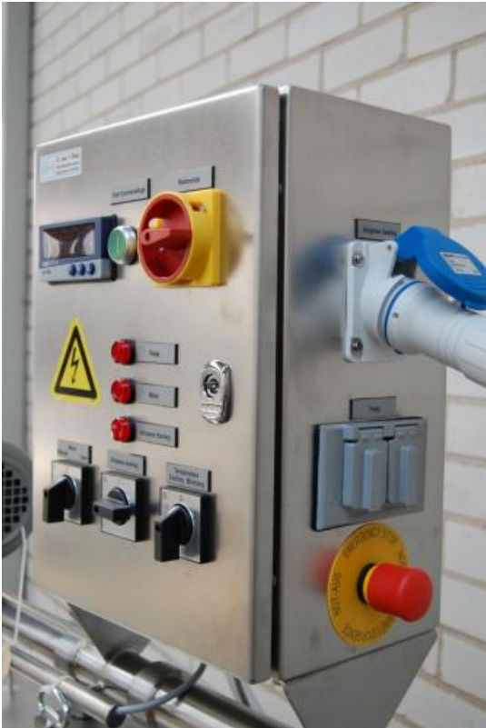
Figure 3 Vat Pasteurizer Control Box Reference Image