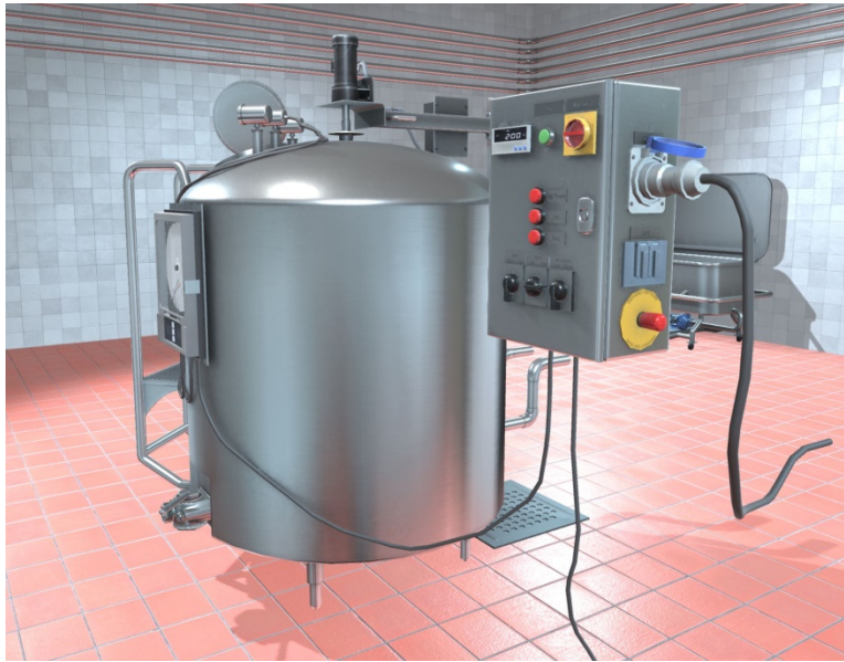
Figure 8 Vat Pasteurizer (Unity)

This model was imported into Unity 5.5 to verify the model (see Figure 8 below).