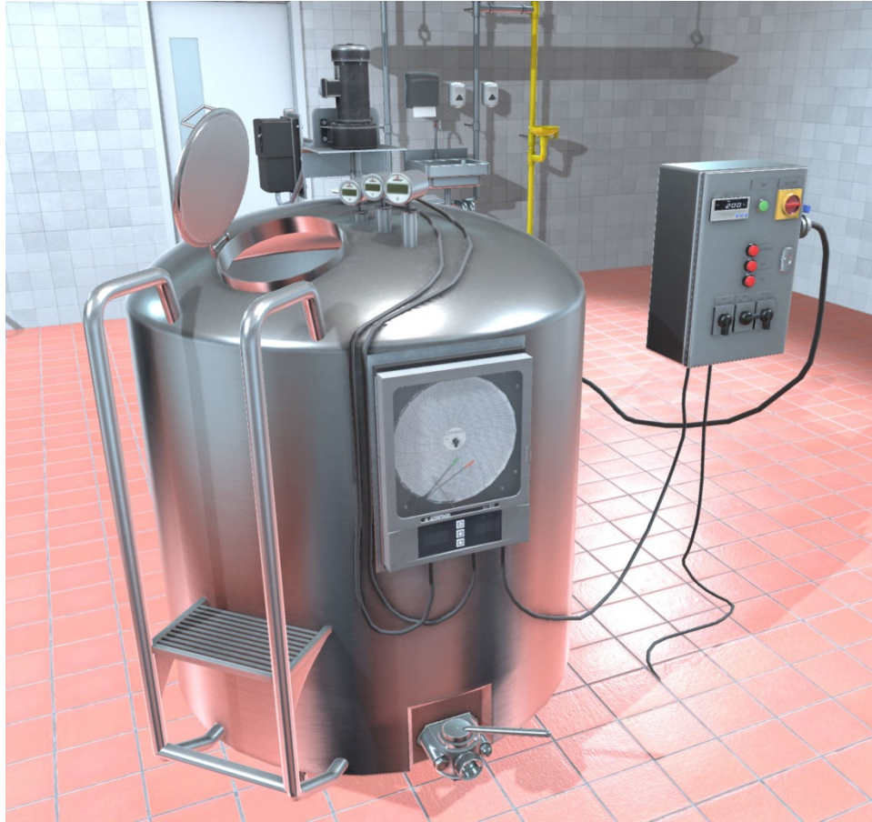
Figure 6 Vat Pasteurizer Model (Unity Render)