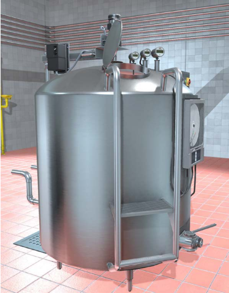
Figure 10 Vat Pasteurizer - Side View (Unity)