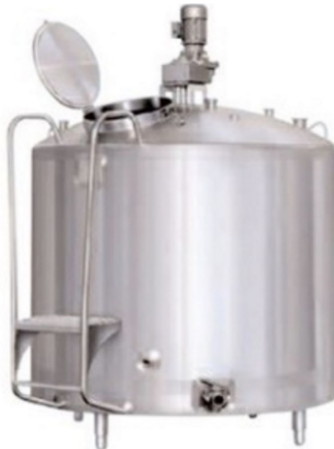
Figure 1 Vat Pasteurizer Reference Image