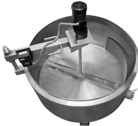
Figure 5 Vat Pasteurizer Agitator Motor Reference Image