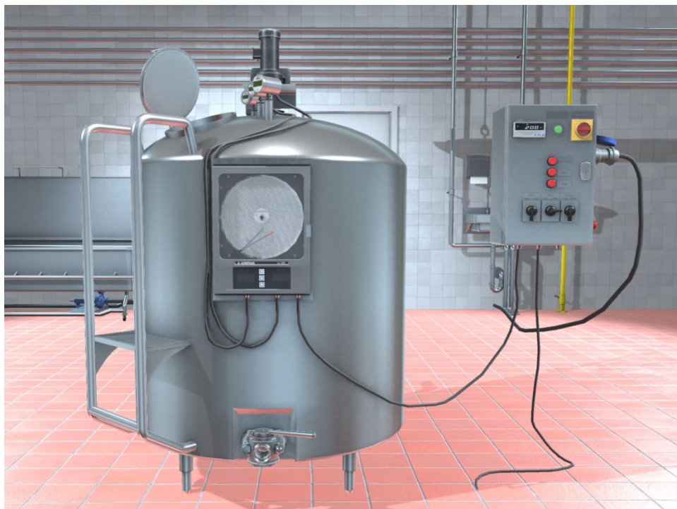
Figure 7 Vat Pasteurizer Origin on Cartesian X, Y, Z Coordinate System (Unity Render)